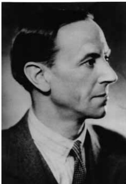
James Chadwick who discovered the neutron in 1932.

F OR THE FIRST FEW decades of this century there did not seem to be any trouble in saying what is meant by an elementary particle. J. J. Thomson could use the electric field in a cathode-ray tube to pull electrons out of atoms, so atoms were not elementary. Nothing could be pulled or knocked out of electrons, so it seemed that electrons were elementary. When atomic nuclei were discovered in Ernest Rutherford's laboratory in 1911, it was assumed that they were not elementary, partly because it was known that some radioactive nuclei emit electrons and other particles, and also because nuclear charges and masses could be explained by assuming that nuclei are composed of two types of elementary particles: light, negatively charged electrons and heavy, positively charged protons.