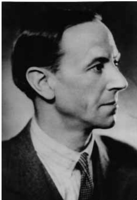
James Chadwick who discovered the neutron in 1932.

F OR THE FIRST FEW decades of this century there did not seem to be any trouble in saying what is meant by an elementary particle. J. J. Thomson could use the electric field in a cathode-ray tube to pull electrons out of atoms, so atoms were not elementary. Nothing could be pulled or knocked out of electrons, so it seemed that electrons were elementary. When atomic nuclei were discovered in Ernest Rutherford's laboratory in 1911, it was assumed that they were not elementary, partly because it was known that some radioactive nuclei emit electrons and other particles, and also because nuclear charges and masses could be explained by assuming that nuclei are composed of two types of elementary particles: light, negatively charged electrons and heavy, positively charged protons.